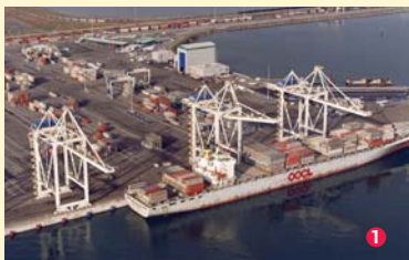
Containers filled with manufactured goods from Asia are unloaded at the Port of Vancouver.

An intermodal complex, such as the one planned by CPR, is a facility that incorporates rail operations and train-truck transfers, along with distribution and storage capabilities. The following photos illustrate the intermodal concept. They show the sequence of activities associated with the Calgary Intermodal Complex, a facility comparable to the one CPR hopes to build in Les Cèdres.