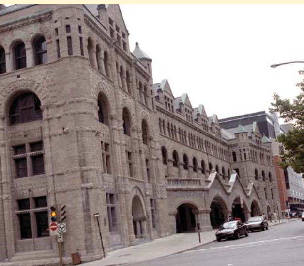
CPR offices, Windsor Station, Montreal

Founded in 1881 to build a railway that would unite the country from coast to coast, CPR has played a pivotal role in the development of Canada's economy ever since. With 16,500 employees, 22,000 km of track, and 44,000 railway cars, the Company generates revenue of over $4 billion annually.