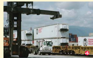
Merchandise is unloaded from trains and transported to the distribution centre, where various activities take place, such as packing and labelling. From there, the merchandise is transported by truck to various locations, including big-box stores in the region.