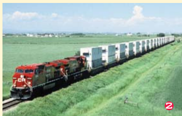
A container train on CPR's transcontinental network, bound for the Calgary Intermodal Complex.