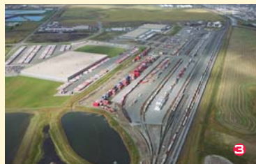
The Calgary Intermodal Complex.